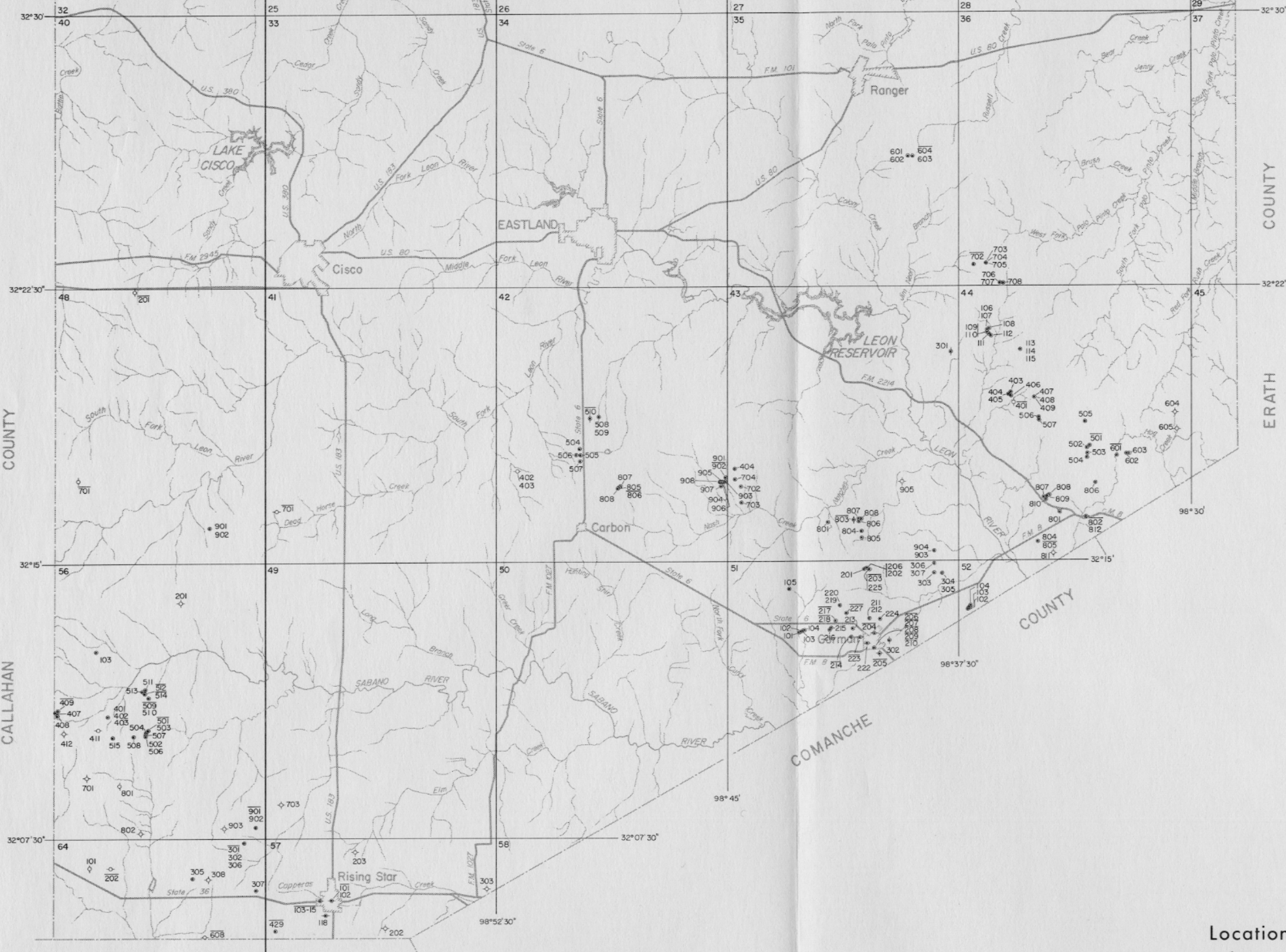
Location of Selected Water, Oil, and Gas Wells in Eastland County