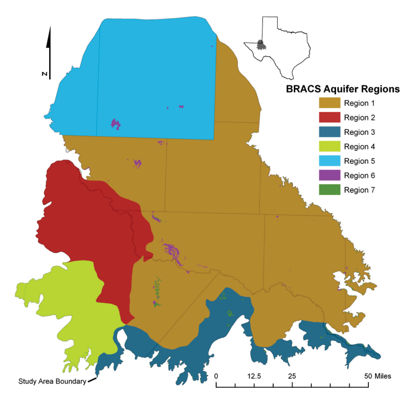
Figure 23.1-1. Regions within the Pecos Valley Alluvium study area. Refer to Table 23.1-2 for the stratigraphic sequence within each region.